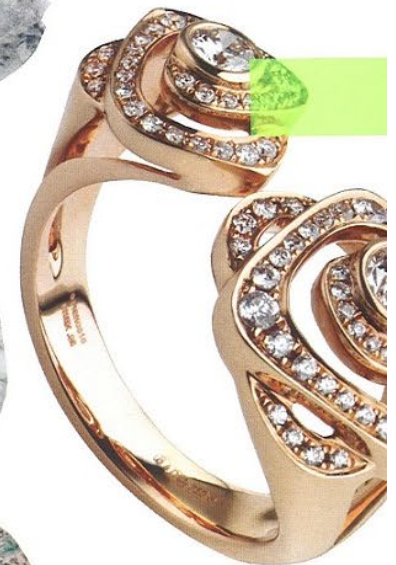
Boodles Maymay Rose ring in rose gold and diamonds, £4,250. Also in white gold