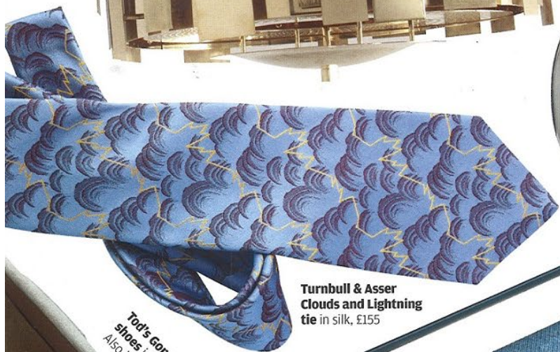
Turnbull & Asser Clouds and Lightning tie in silk, £155