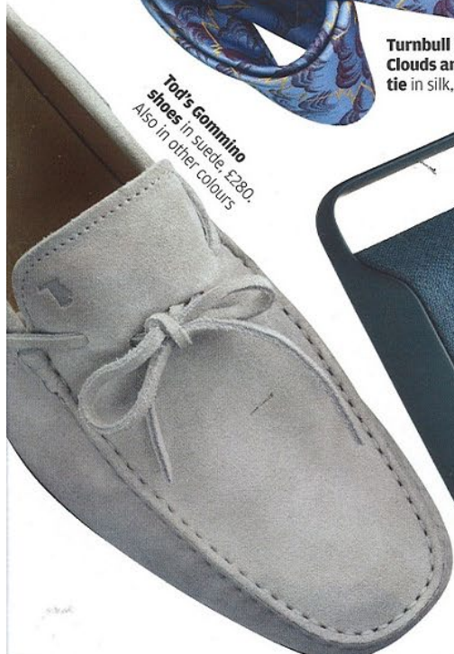
Tod's Gommino shoes in suede, £280. Also in other colours