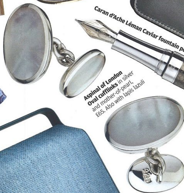
Aspinal of London Oval cufflinks in silver and mother-of-pearl, £65. Also with lapis lazuli

LOOKING FOR A GIFT? FIND 800+ IDEAS IN OUR INSPIRATIONAL GIFT GUIDE, UPDATED DAILY ON WWW.HOWTOSPENDIT.COM