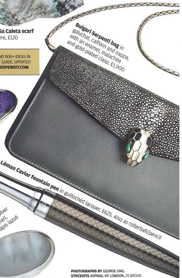
Caran d'Ache Léman Caviar fountain pen in guilloché lacquer, £625. Also as rollerball/pencil

STOCKISTS ASPINAL OF LONDON, 25 BROOK ST, LONDON W1 (0845-052 6900; WWW.ASPINALOFLONDON.COM) AND BRANCHES. BOODLES, 178 NEW BOND ST, LONDON W1 (020-7437 5050; WWW.BOODLES.COM) AND BRANCHES/STOCKIST. BULGARI, 168 NEW BOND ST, LONDON W1 (020-7872 9969; WWW.BULGARI.COM) AND BRANCHES/STOCKISTS. CARAN D'ACHE, WWW.CARANDACHE.COM AND SEE HARRODS. THE CONRAN SHOP, MICHELIN HOUSE, 81 FULHAM RD, LONDON SW3 (020-7589 740; WWW.CONRANSHOP.CO.UK). DAVID CLULOW, WWW.DAVIDCLULOW.COM. HARRODS, 87-135 BROMPTON RD, LONDON SW3 (020-7730 1234; WWW.HARRODS.COM). JOHN LEWIS, 300 OXFORD ST, LONDON W1 (0844-693 1765; WWW.JOHNLEWIS.COM) AND BRANCHES. LILY AND LIONEL, WWW.LILYANDLIONEL.COM. MIU MIU, WWW.MIUMIU.COM AND SEE DAVID CLULOW. PORTA ROMANA, GS, DESIGN CENTRE CHELSEA HARBOUR, LONDON SW10 (01420-23005; WWW.PORTAROMANA.CO.UK). TAG HEUER, WWW.TAGHEUER.CO.UK. TOD'S, 2-5 OLD BOND ST, LONDON W1 (020-7493 2237; WWW.TODS.COM) AND BRANCHES. TURNBULL & ASSER, 71-72 JERMYN ST, LONDON SW1 (020-7508 3000; WWW.TURNBULLANDASSER.CO.UK). VIFA, WWW.VIFA.DK AND SEE THE CONRAN SHOP, WATERFORD, WWW.WATERFORD.CO.UK AND SEE JOHN LEWIS AND OTHER STOCKISTS.