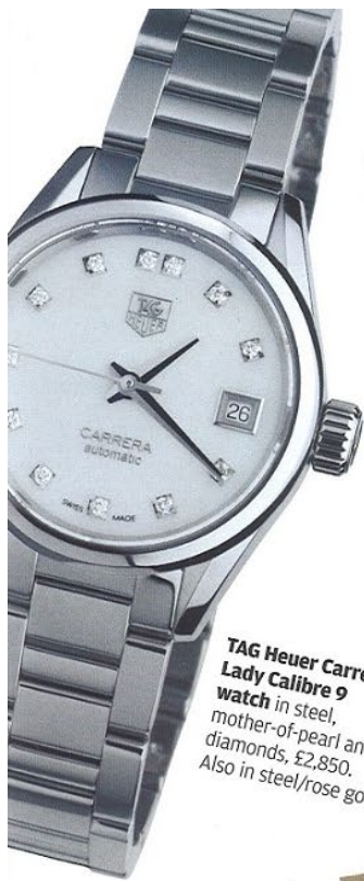
TAG Heuer Carrera Lady Calibre 9 watch in steel, mother-of-pearl and diamonds, £2,850. Also in steel/rose gold