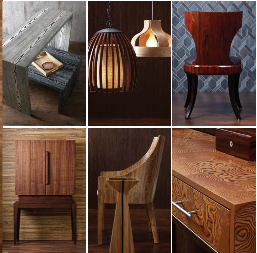
Aronson Woodworks "Waterfall" ash tables. Currey & Company "Carling" slatted fruitwood pendant. Camevale Studio "Bound" maple pendant. Jonathan Charles "Art Deco" rosewood klismos chair. Diesel "Hideaway" chest with wooden pulls. JKM Home "Theo" zebra table with mirrored top. Made Goods "Everett" chair in olive ash veneers. Chelsea House "Andres" olive wood console table.