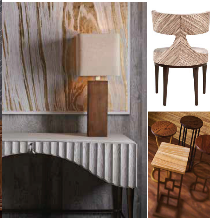
Bernhardt "Domaine Blanc" desk in white oak with stainless-steel legs. Jayson Home "Randers" recycled-wood square lamp. Natural Curiosities "Gold Wood Grain" gold-leaf paper artwork. Thibaut "Eastwood" wallpaper in gray. Reagan Hayes "Oscar" dining chair in tiger maple. Kelbey Road Oak accessory tables with recycled steel bases.